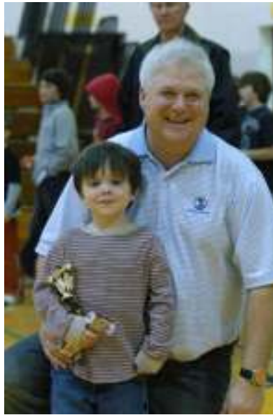
What a team!