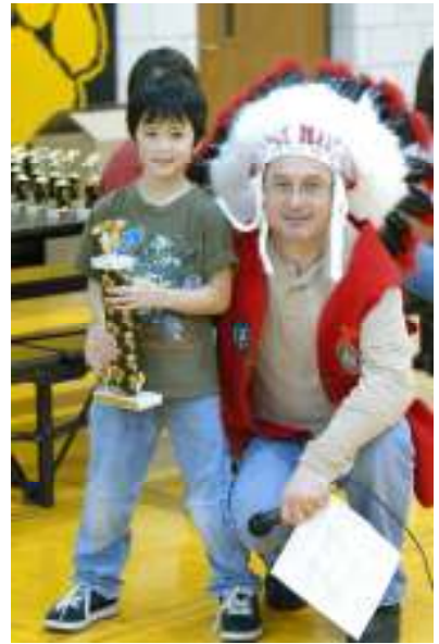
Gonna need a bigger shelf