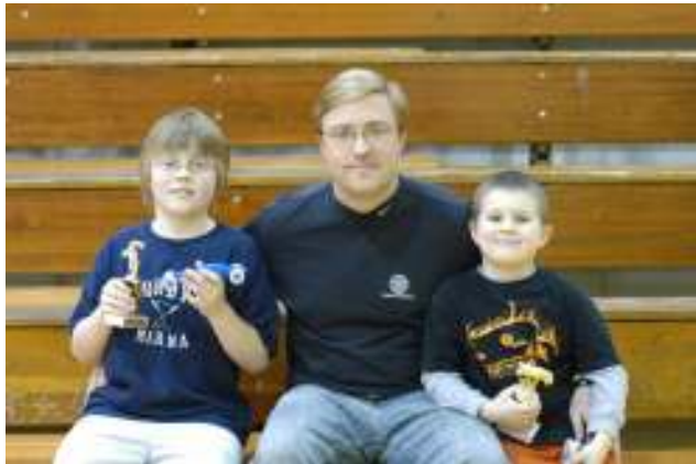
A family of winners