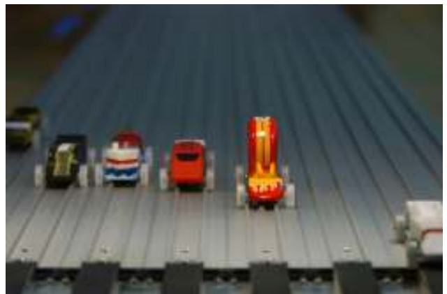
That's one quick snail!